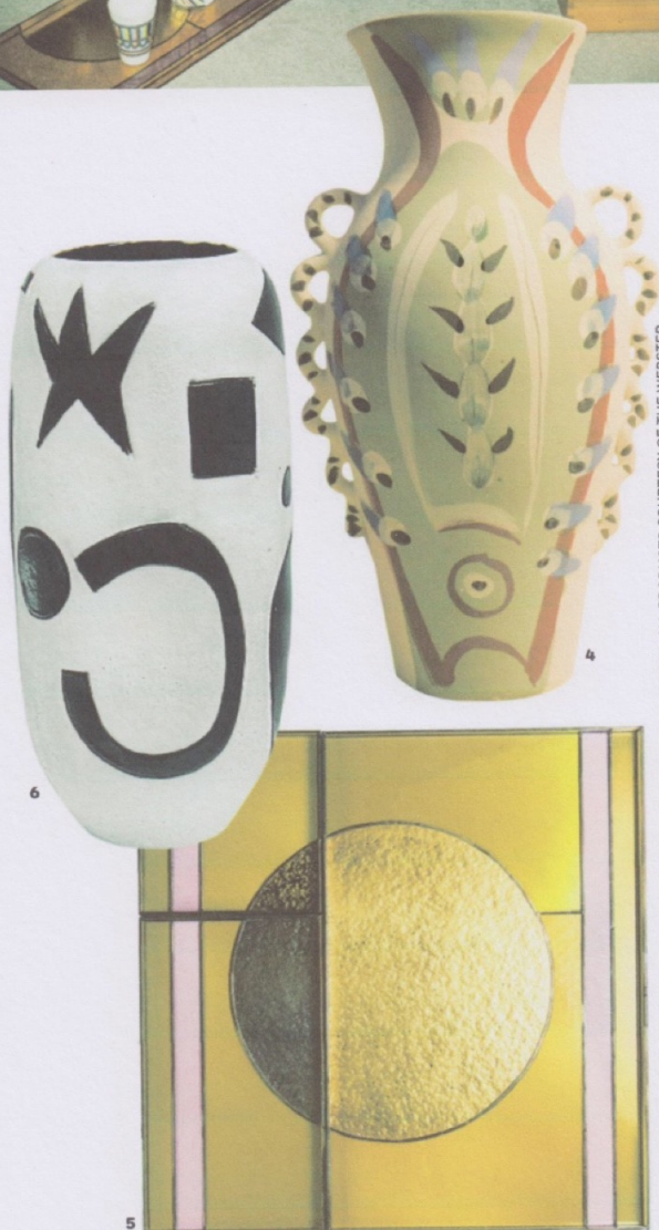
HAIR AND MAKEUP BY CHARLOTTE SARRAY; ALL PRODUCTS COURTESY OF THE WEBSTER